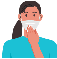
DON'T touch front of mask