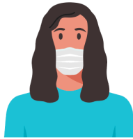
DON'T leave hair down on face