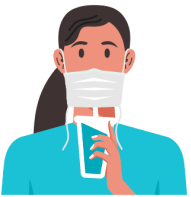
DON'T drink with mask on