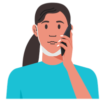
DON'T remove to talk on phone