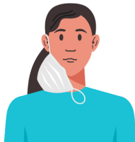
DON'T hang from one ear