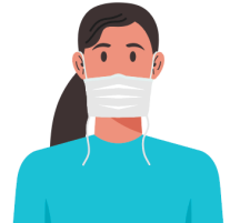
DON'T leave strap hanging