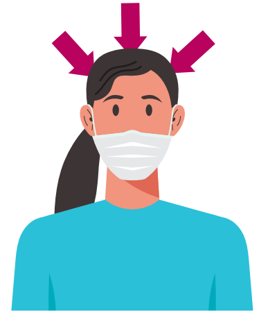
DO remove by grabbing from back