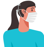
DON'T cross straps in back