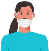
DON'T pull below nose