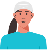
DON'T wear on forehead