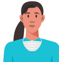
DON'T hang around neck