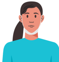
DON'T pull below chin