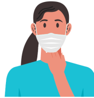
DON'T reach under mask