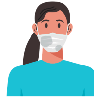
DON'T wear a dirty or wet mask