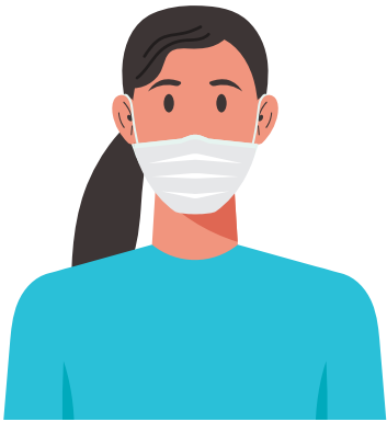
DO cover nose and mouth