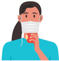
DON'T eat with mask on