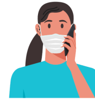
DON'T touch phone to mask