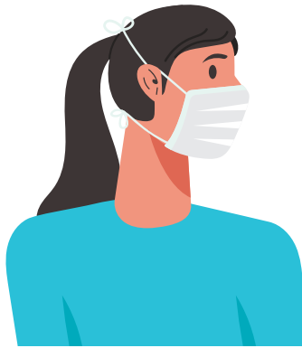
DO tie straps behind head