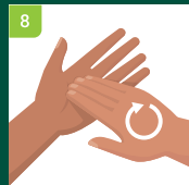
8 Rotational rubbing, backwards and forwards with clasped fingers of right hand in left palm and vice versa