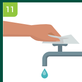
11 Use elbow or paper towel to turn off tap