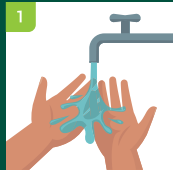
1 Wet hands with water