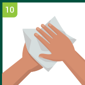
10 Dry hands thoroughly with a paper towel or air dryer