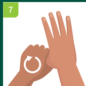
7 Rotational rubbing of left thumb clasped in right palm and vice versa