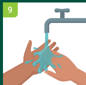
9 Rinse hands under running warm water