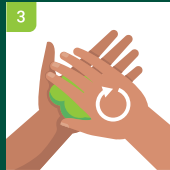
3 Rub hands palm to palm