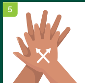
5 Palm to palm with fingers interlaced