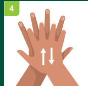
4 Rub palm over the back of the other hand with interlaced fingers and vice versa