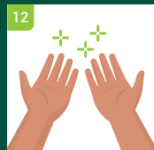
12 Your hands are clean!