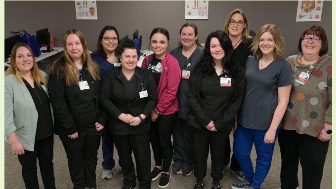
In March, Genesis Health System launched its Medical Assistant Student Program for colleagues to help address a shortage.

was made possible thanks to a generous grant from the Jasper Community Foundation. This specially designed set of parallel bars works in conjunction with an overhead harness system and an underfoot "slip trainer."